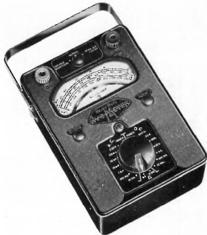
Heavy Duty Avometer Mk. 5

No information on diagrams in whole or part may be copied or reproduced without the prior permission in writing of AVO LIMITED. Whilst every care has been taken in the compilation of this publication, Avo Ltd. cannot accept any liability due to errors in the text.